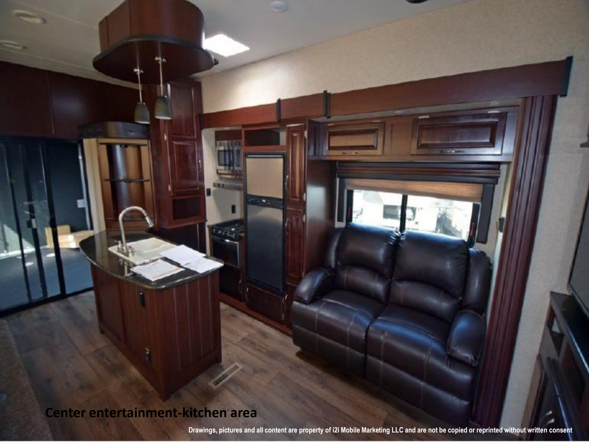
Center entertainment-kitchen area