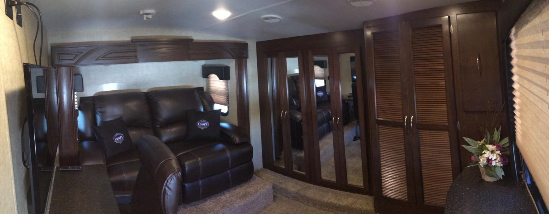
Front Lounge Meeting Area