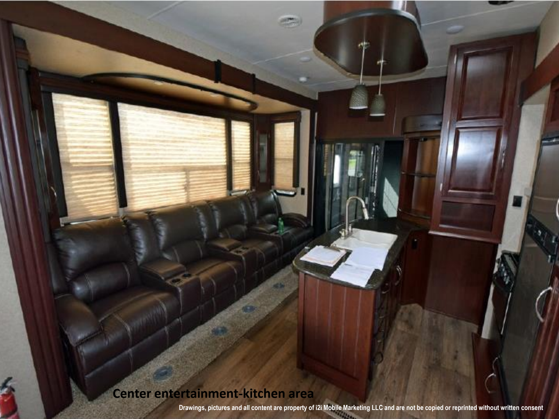
Center entertainment-kitchen area