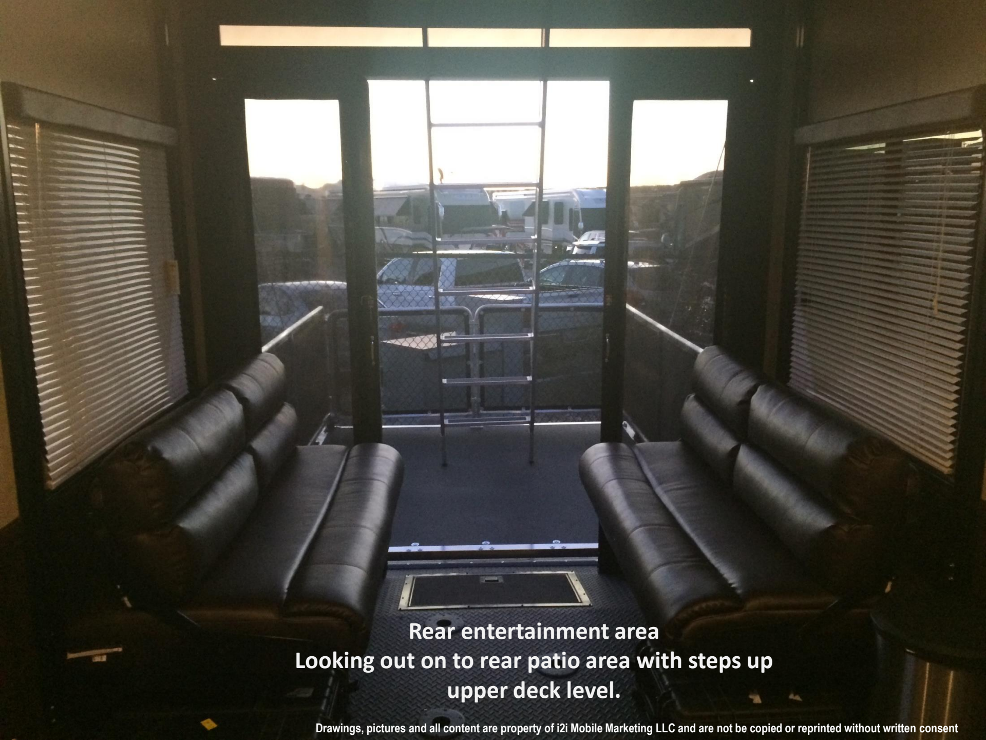
Rear entertainment area Looking out on to rear patio area with steps up upper deck level.