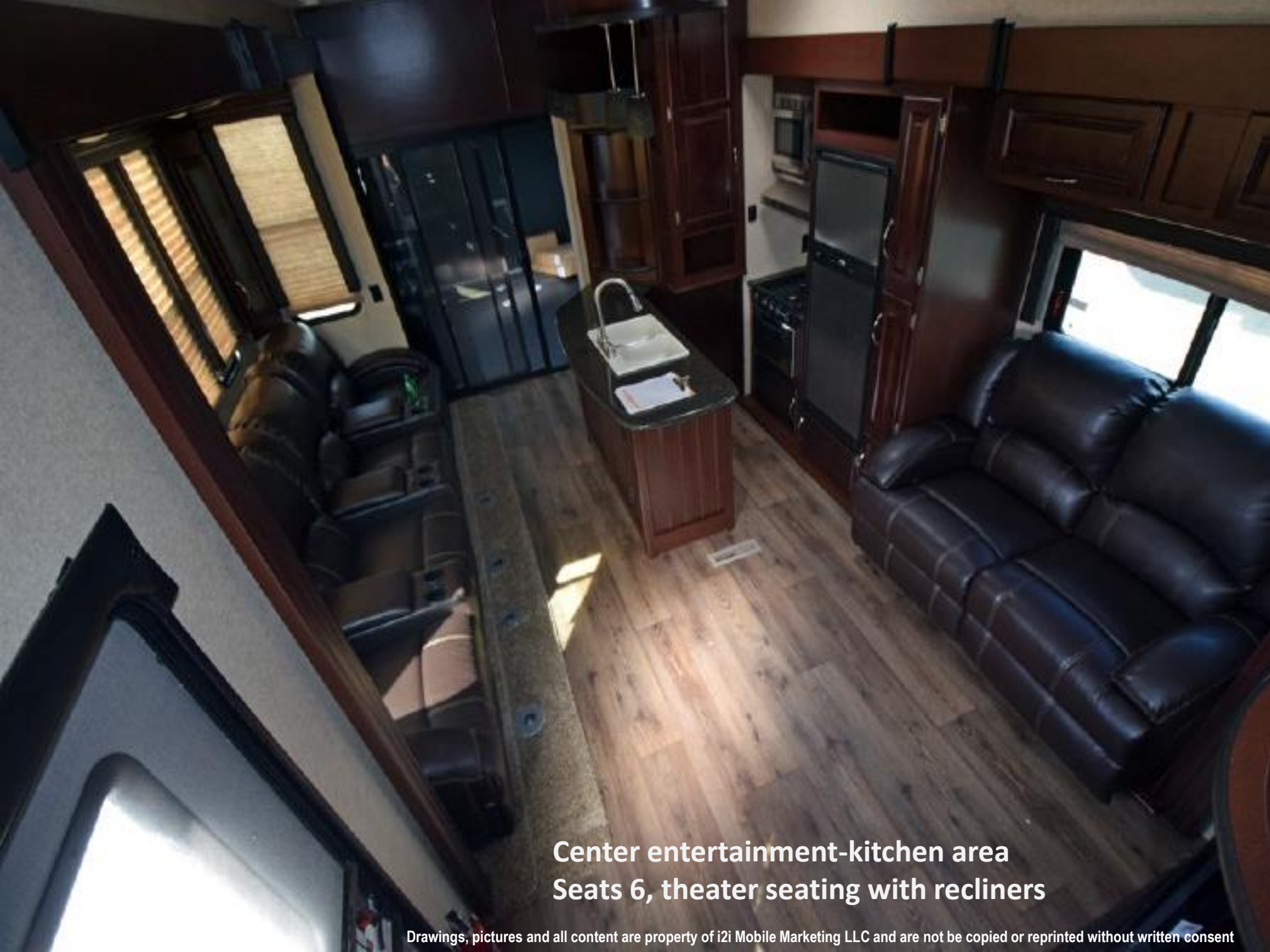
Center entertainment-kitchen area Seats 6, theater seating with recliners